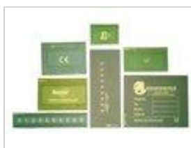
LONG- LIFE STENCILS