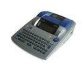
STENCIL PRINTER SD03