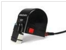
Etching- Set GG07 Mobile