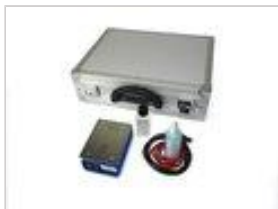
Etching- Set GG03 Mini