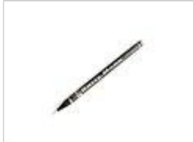
BRITE- MARK® 33