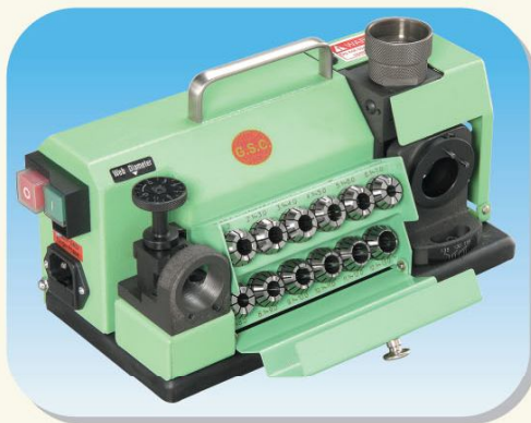
Invisible Tool Box