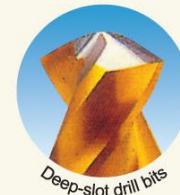
Deep-slot drill bits