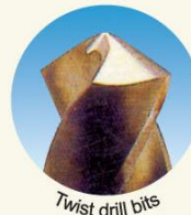
Twist drill bits