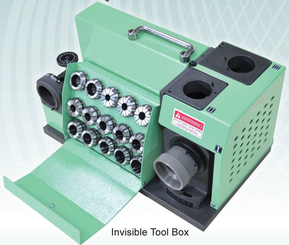
Invisible Tool Box