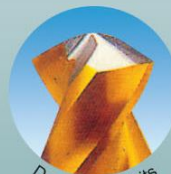
Deep-slot drill bits