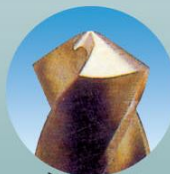
Twist drill bits