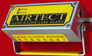
LA508-M (8-Zone Manifold Unit)