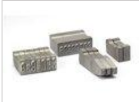
Steel types for stamping guns GIMA P & Hilit