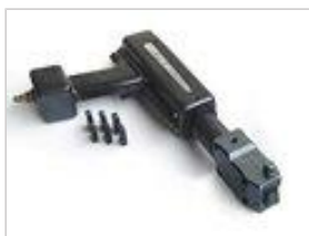
GIMA "S" STAMPING GUN, pneumatic