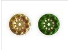
Disc cartridges SPIT for GIMA P