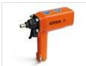
GIMA "A" STAMPING GUN, pneumatic