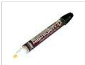
High Purity 44