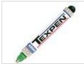
TEXPEN® ball marker