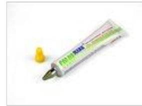
COLORMARK ball marker