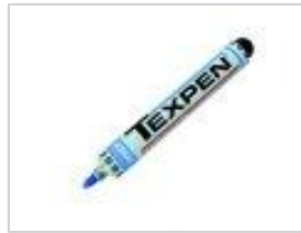
TEXPEN® with fine point